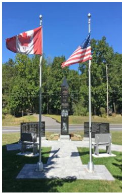
(Cdn. CW Memorial)